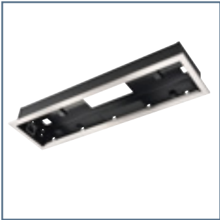
Optional accessories available to purchase such as extension poles and flush mount enclosures.

HARDWIRED (TT-MTM) Wall mounted controller and remote control.